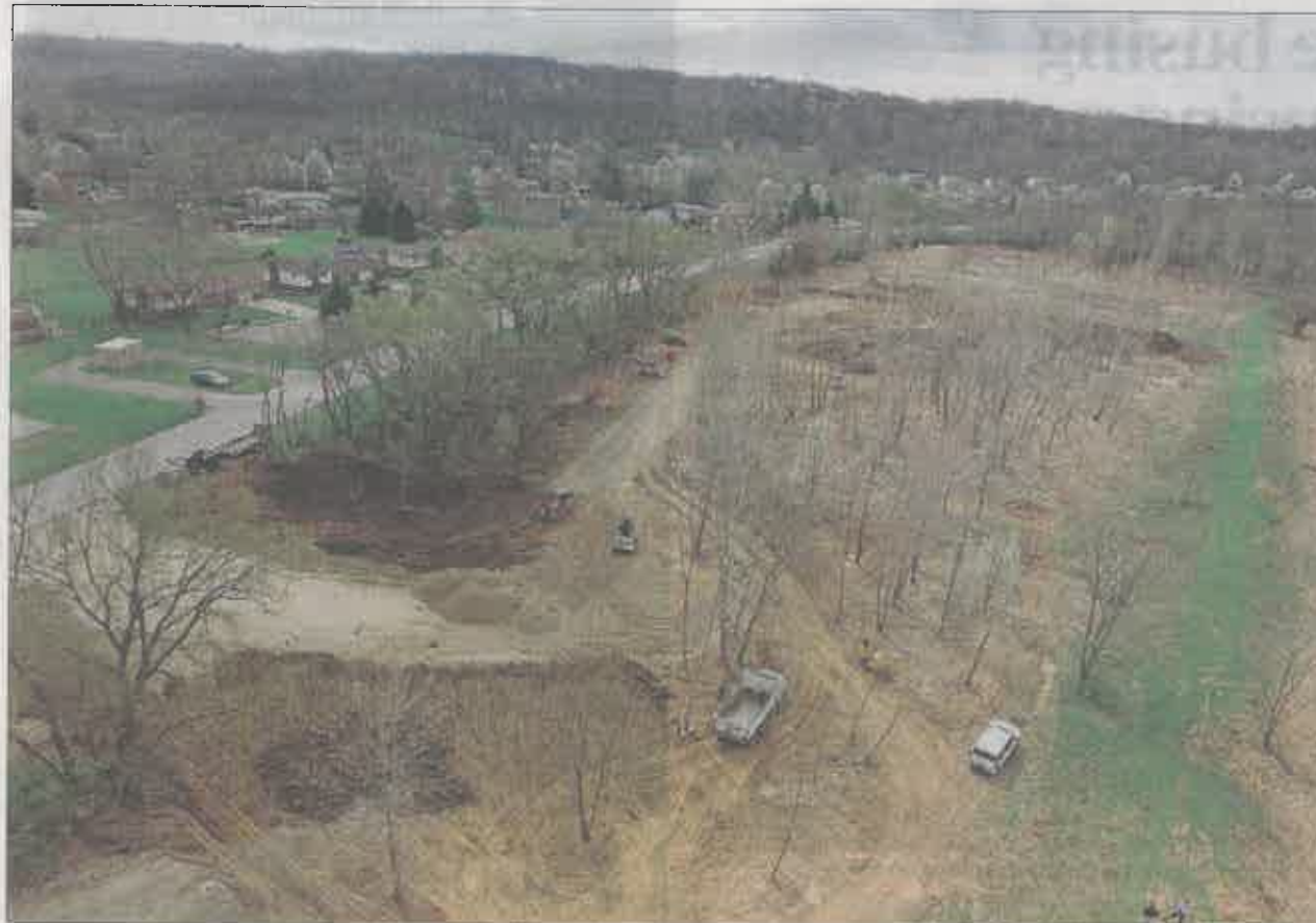
The Fairfield dog park will be completed this summer, and will feature more amenities than just a dog park. Pictured is an aerial photo of the early progress in April 2019 of the dog park in Fairfield.